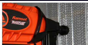
Lath attachment—using one-inch TrakFast discs and magnetic probe adapter