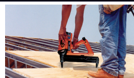
Plywood attachment—using TrakFast plywood to steel pin