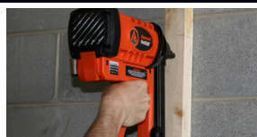
Furring attachment—perfect fastening every time in soft and hard base materials