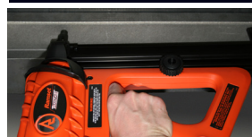
Track to steel